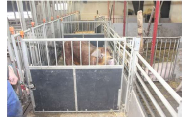
The boar is doing Ahaa -reaction on front of sows

The boar is sexually mature at earliest when it is 7 to 8 month old. It is recommended to take the boar on use when it is over 8 month old.