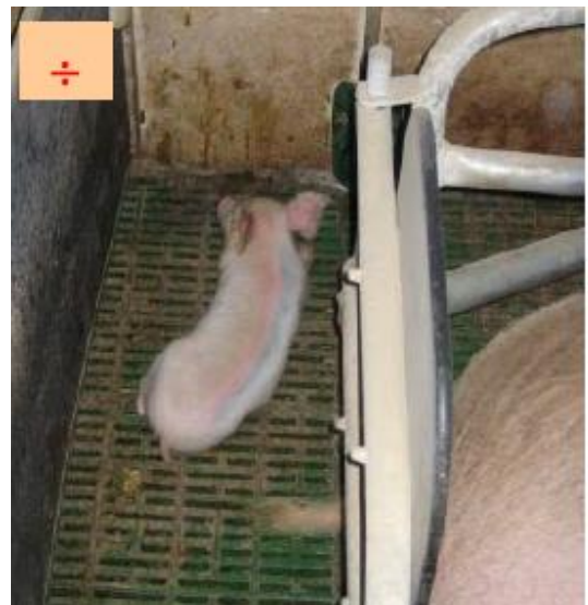
Sick piglet that should not be moved