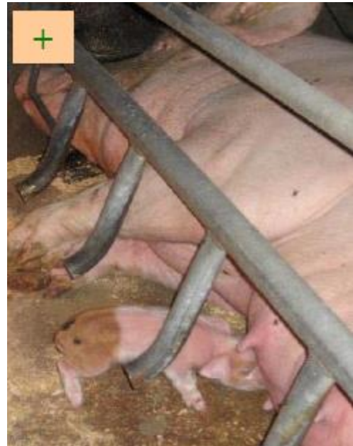
Hungry piglet that should be moved to a foster sow